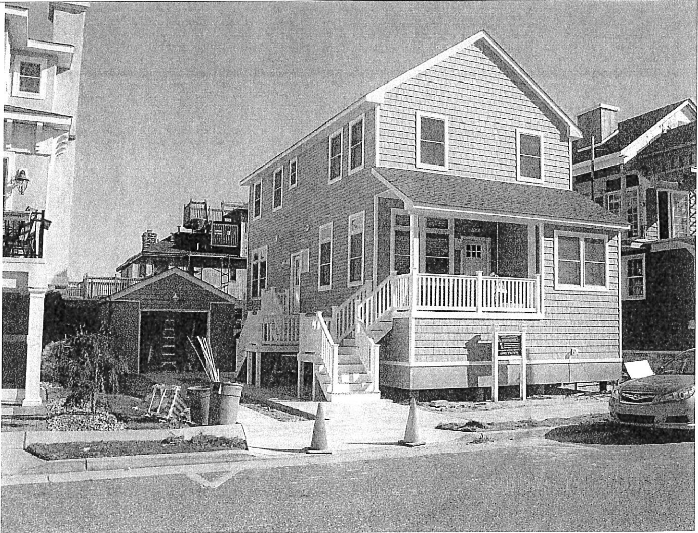
View: Front / Left Side

If using the Elevation Certificate to obtain NFIP flood insurance, affix at least 2 building photographs below according to the instructions for Item A6. Identify all photographs with date taken; "Front View" and "Rear View"; and, if required, "Right Side View" and "Left Side View." When applicable, photographs must show the foundation with representative examples of the flood openings or vents, as indicated in Section A8. If submitting more photographs than will fit on this page, use the Continuation Page.